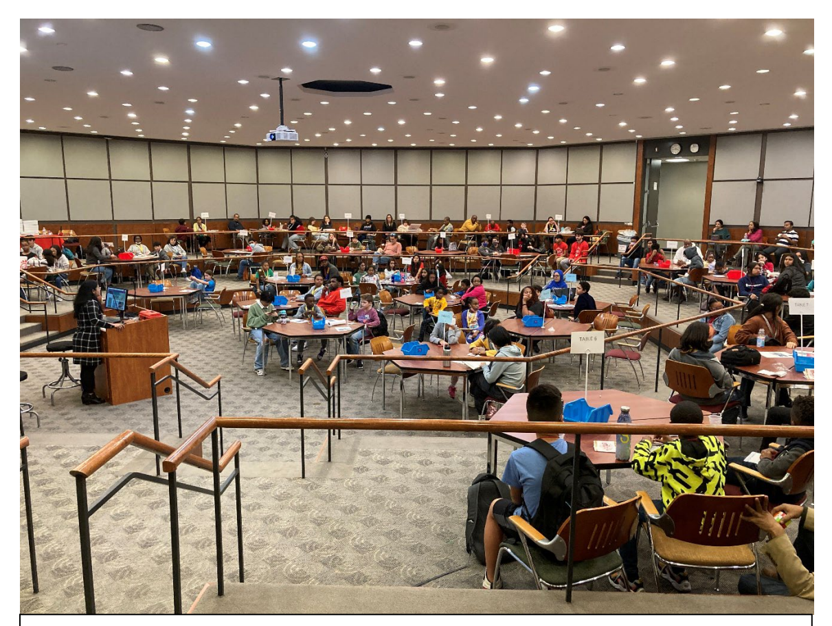
Nabila Shamim, from PVAMU's Department of Chemical Engineering, presented on Hydrogen Production by Electrolysis of Water to an energized audience of grade-school students.

Approximately 100 students in grades 3-12 attended, many of them accompanied by their