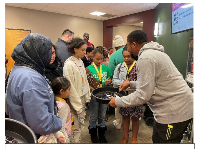
Grade-school students participated in hands-on activities, mentored by university students.