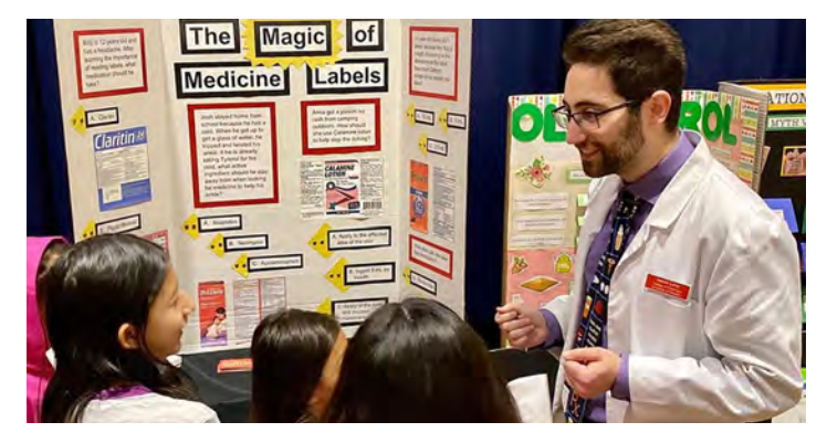
DHR Community Health Fair in RGV

Several UHCOP Pharm.D. students traveled to Edinburg for the third year to participate in the DHR Health Community Health Fair Jan. 18, where students and practitioners from various disciplines provided more than 100 flu immunizations, 300-plus wellness screenings and education on various health and safety topics.