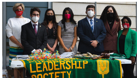
PLS advisors and officers held a drive-through induction ceremony in spring 2021 due to pandemic social distancing safeguards.

The chapter held several workshops ranging from candidacy preparation, elevator pitches and mentorship, and public speaking to "leading from behind," resilience and grit, and emotional intel-