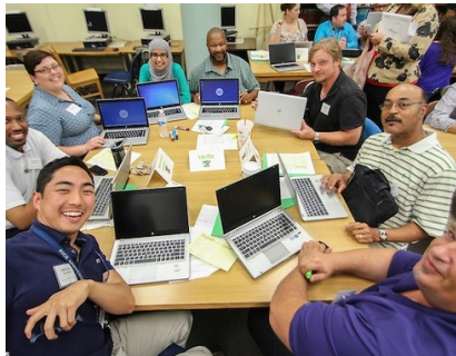
Teachers in training at Sharpstown High.