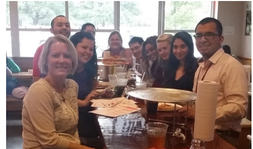
On 10-28-14 alumni bonded at Pink's Pizza at UH