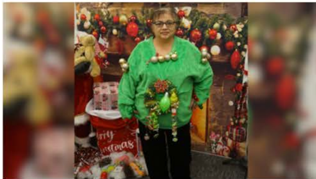
Ugly Sweater Award