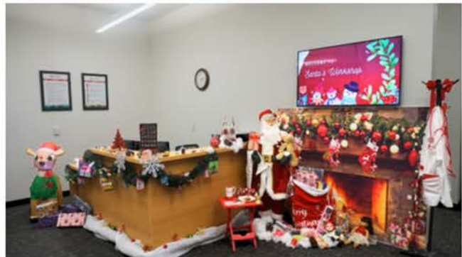
Office Holiday Decoration Award