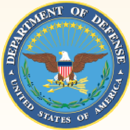
Department of Defense