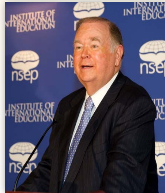
David L. Boren