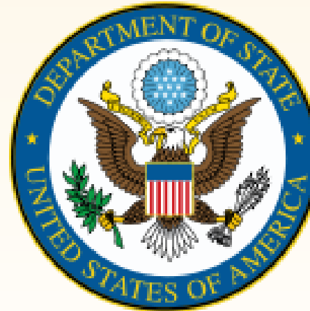
Department of State