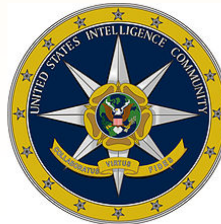
The Intelligence Community