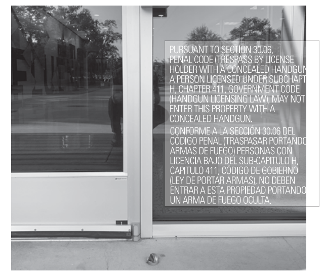
REFERENCE IMAGE - TYPICAL PLACEMENT, SINGLE MYLAR ADHESIVE