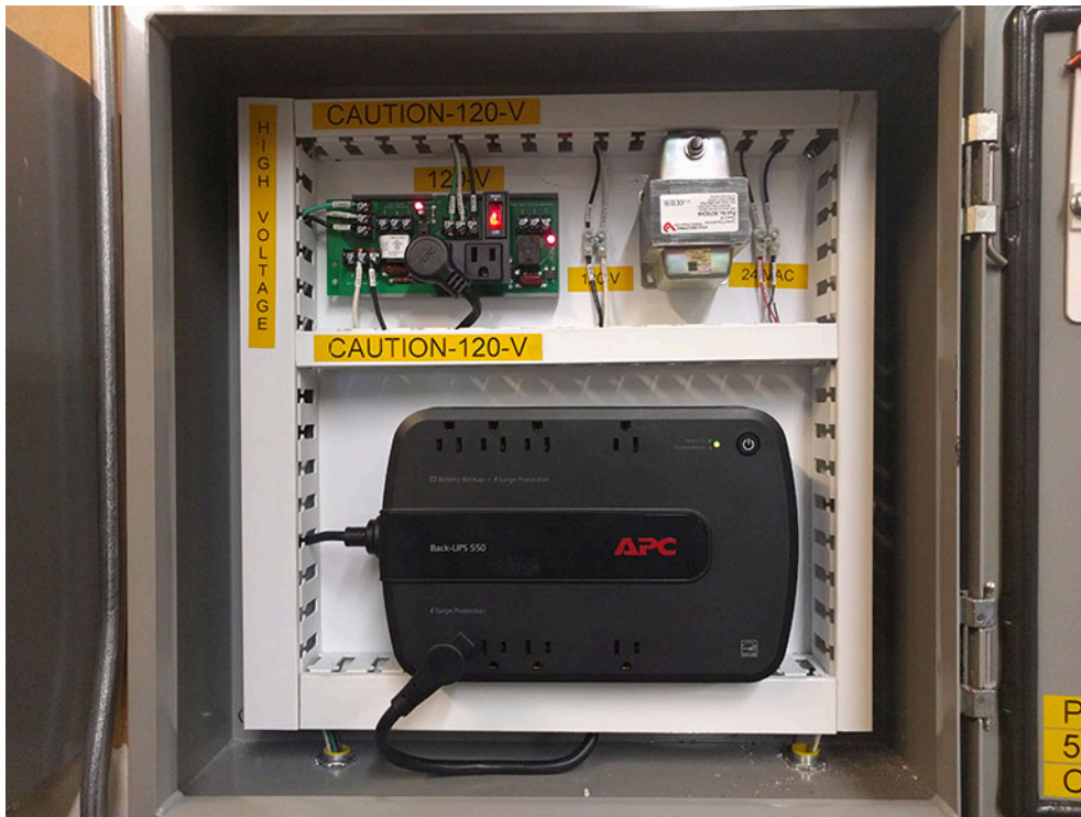
FIGURE B: HIGH VOLTAGE PANEL