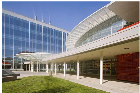
Existing Loggias at Agnes Arnold Hall, PG Hoffman, Science Engineering Classroom