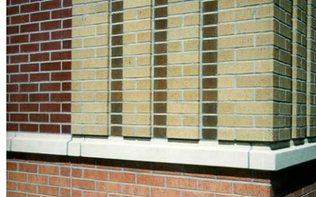
Brick colors in Moores' Music School