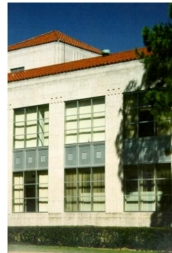
Original Color Palette

A related color theme is the strong greens of the landscaping that are a key to the overall “urban forest” appearance of the campus. The predominance of lighter colors or tones in the buildings contrasts nicely with the darker, richer colors and shadows of the landscape. Occasional accents of color in plants or sculpture are preferable to bright colors on the buildings.