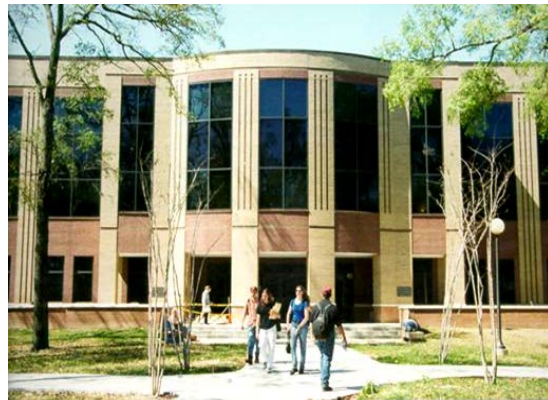
Examples of Well-Defined Entrances