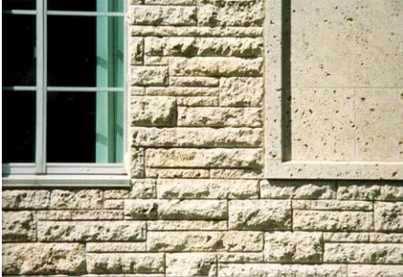
Detail of materials in dormitory group

for this campus. On the other hand, the same buff brick has been used on many buildings but by varying the color of the mortar, or by blending with other brick shades, the overall tone of the walls is varied noticeably while remaining within the “family” concept. Recent construction has incorporated, in small areas, the use of red on an interior face of spandrel glass, which provides a bold and low-maintenance splash of color.