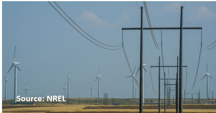
Electrification – One Key to Decarbonization

Decarbonization has become a major theme in industry, driven by the growing focus of stakeholders on ESG (environmental, social and governance). Energy efficiency plays a major role in this, but our Spring Energy Forum focused on two other important technologies – electrification and biofuels. Our next event also focuses on decarbonization – see below.