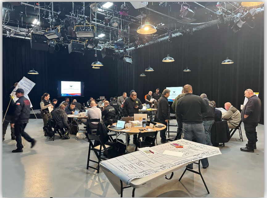
→ OEM hosted FEMA 300/400 Training

Office of Emergency Management www.uh.edu/oem