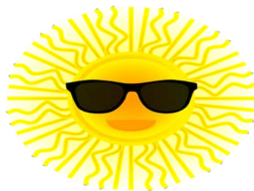
A very busy summer with camps, baseball games, sailing and attending parent trainings