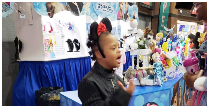
Disney on Ice