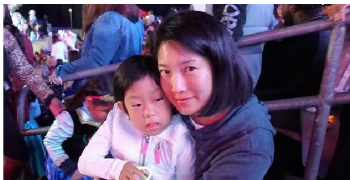
Disney on Ice