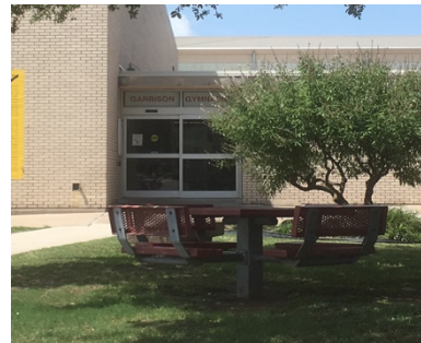
Entrance glass doors into Garrison Gym