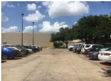
Continue straight towards the door upon entering the Garrison Parking lot (15C)