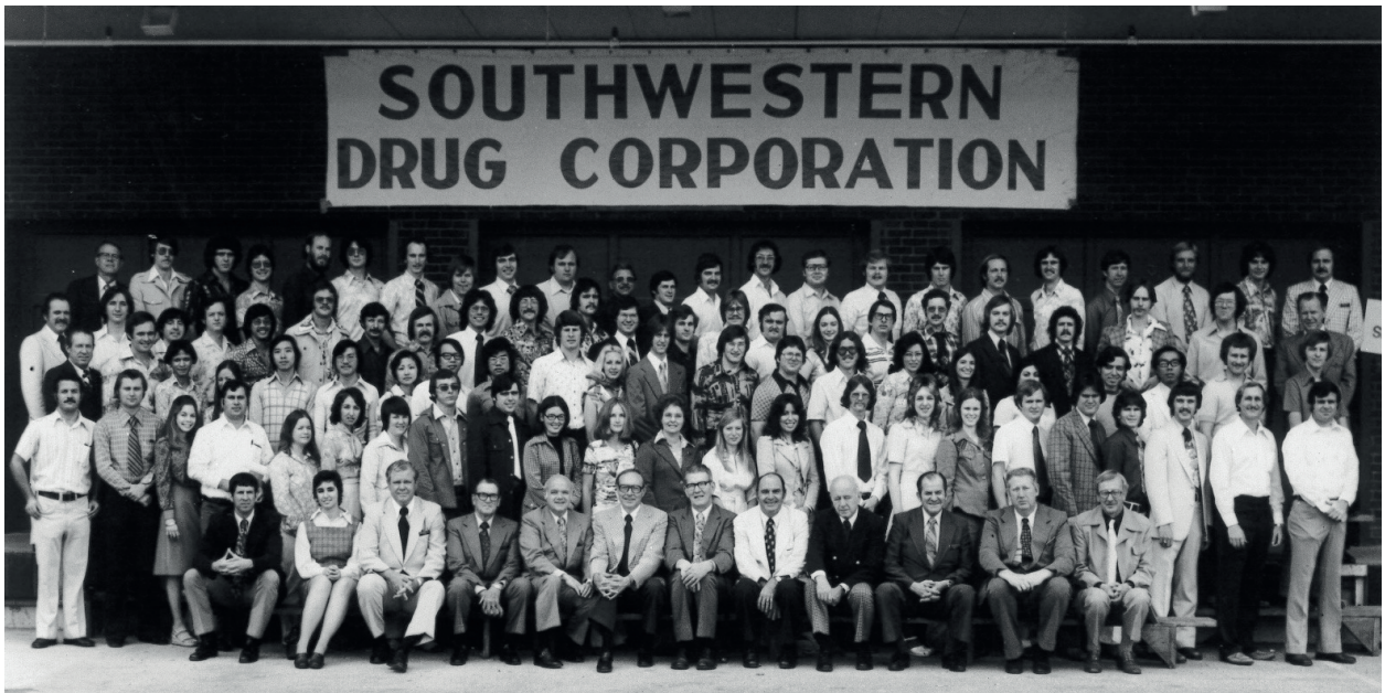
The University of Houston College of Pharmacy's faculty, staff, and students salute the Class of 1976 on the occasion of their 50th Anniversary of their Commencement.