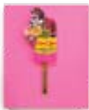
Topo Floral 5, 2024 (acrylic, resin, paper on canvas)