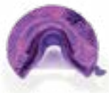
Bright Purple, 2024 (clay, resin, foil)