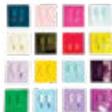
No Looking Back, 2023 (acrylic, resin on wood)