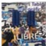
Navy and Black Double Pop Collage, 2024 (paper, acrylic on wood)