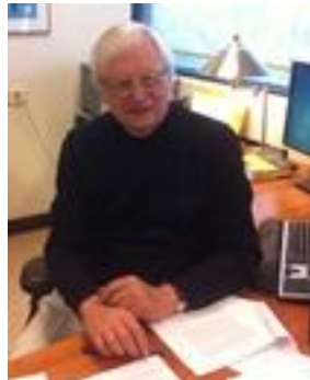
Professor Kent Tedin

In an experiment, respondents are randomly assigned to a variety of different treatments, along with a control group, which makes it possible to test any number of hypotheses. The advent of Internet surveys has made experiments in