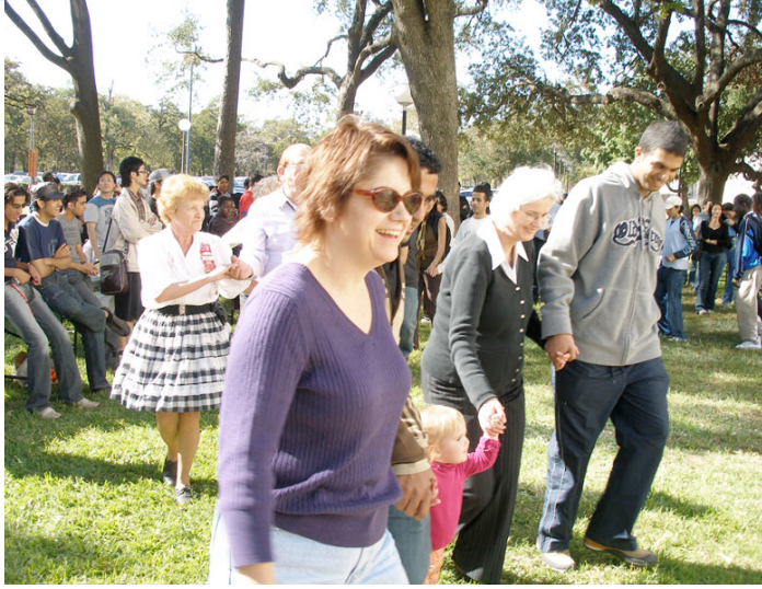
AT THE FALL 2005 CULTURE FESTIVAL, LCC STUDENTS LEARNED SQUARE DANCING, LINE DANCING, AND THE THE COTTON-EYED JOE. THEY ALSO SHARED MUSIC AND DANCE FROM THEIR COUNTRIES.