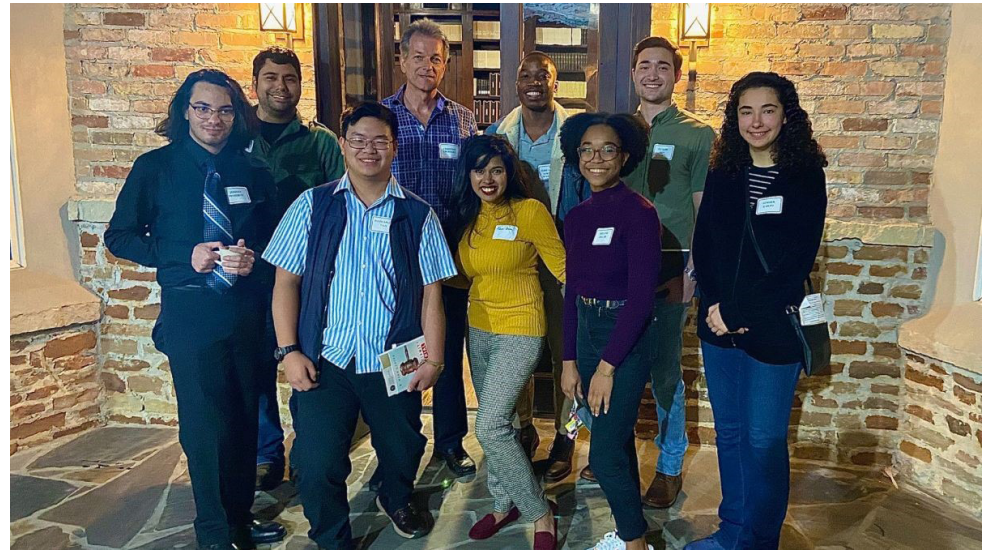
Religious Studies Majors and Minors at the Lanier Theological Library (photo taken February 8, 2020)

Last semester launched with a successful gathering of students and faculty at the Religious Studies annual luncheon. In addition to this traditional meeting, new student engagement efforts helped foster a stronger culture among our passionate community of Religious Studies students and faculty.