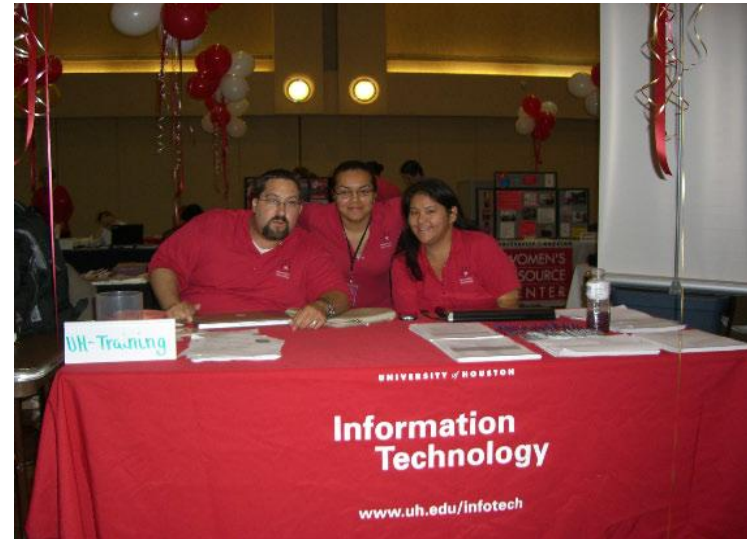
UH – IT Technical Support Services (TSS)