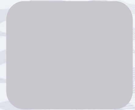
Metal Panel- Duracron S600 Gray Metallic