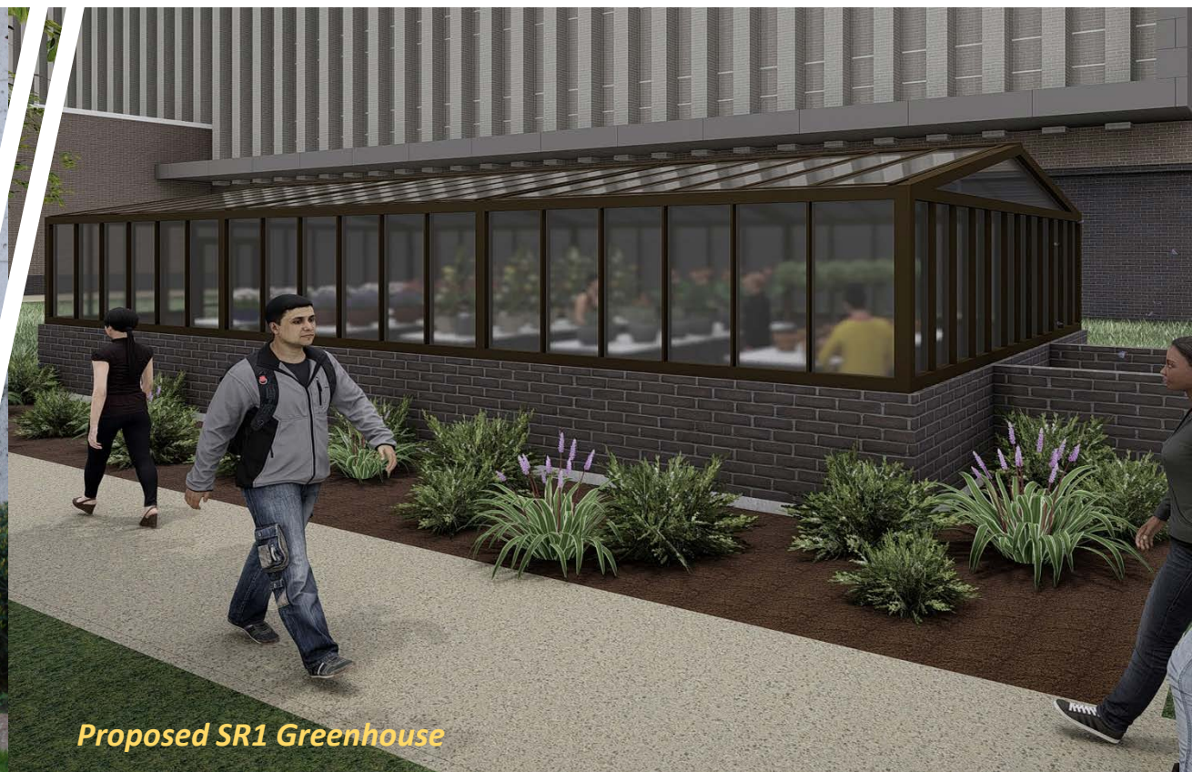
Proposed SR1 Greenhouse