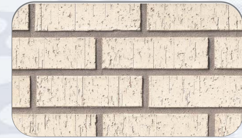
Brick No.1 – “Meridian V100”