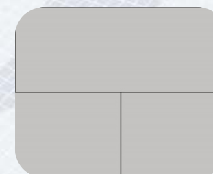
Metal Panel – “Anodized Aluminum”