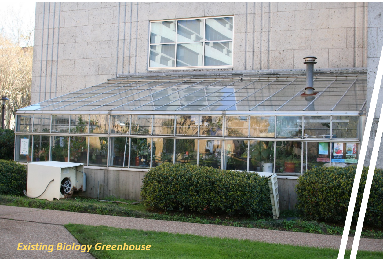
Existing Biology Greenhouse