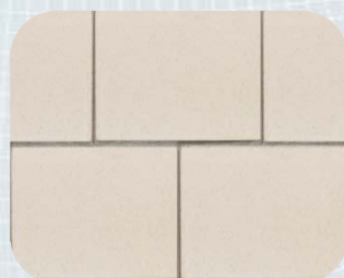
CSMU Arristcraft Oak Ridge