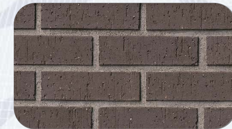
Brick No.3 – “Meridian V500”