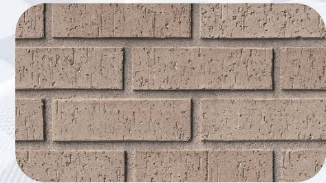
Brick No.2 – “Meridian V228”