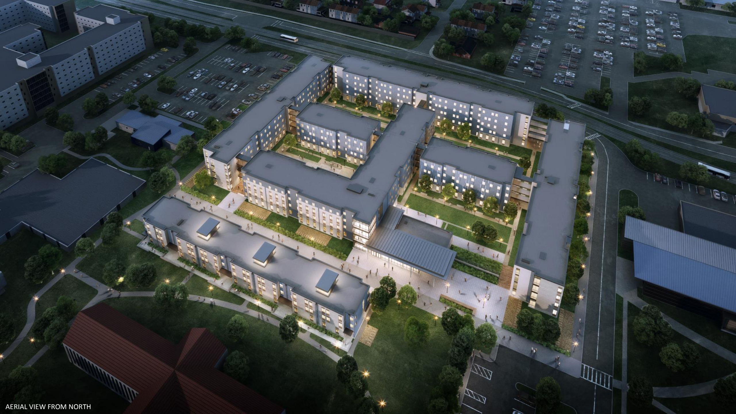
AERIAL VIEW FROM NORTH