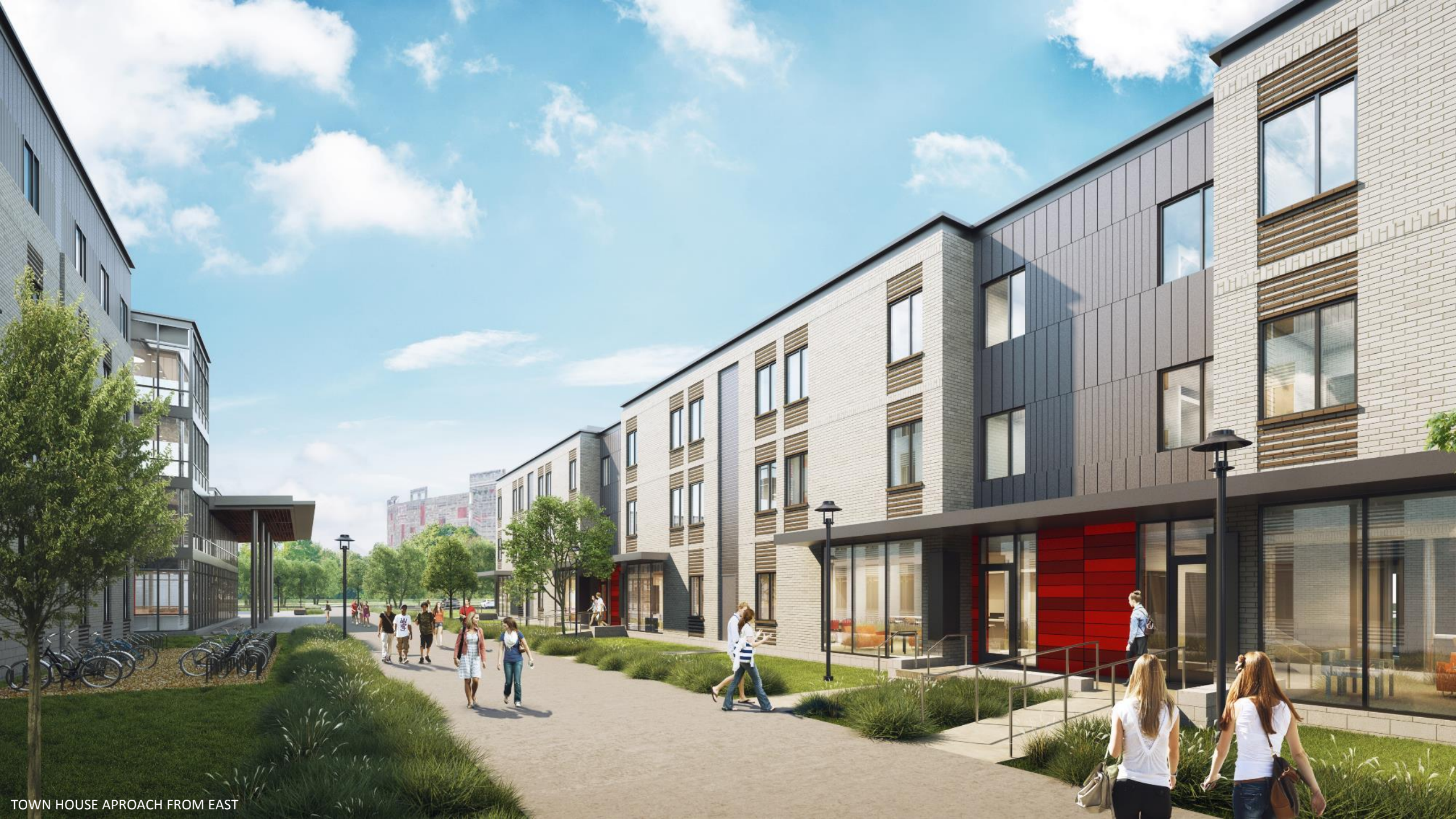
TOWN HOUSE APPROACH FROM EAST