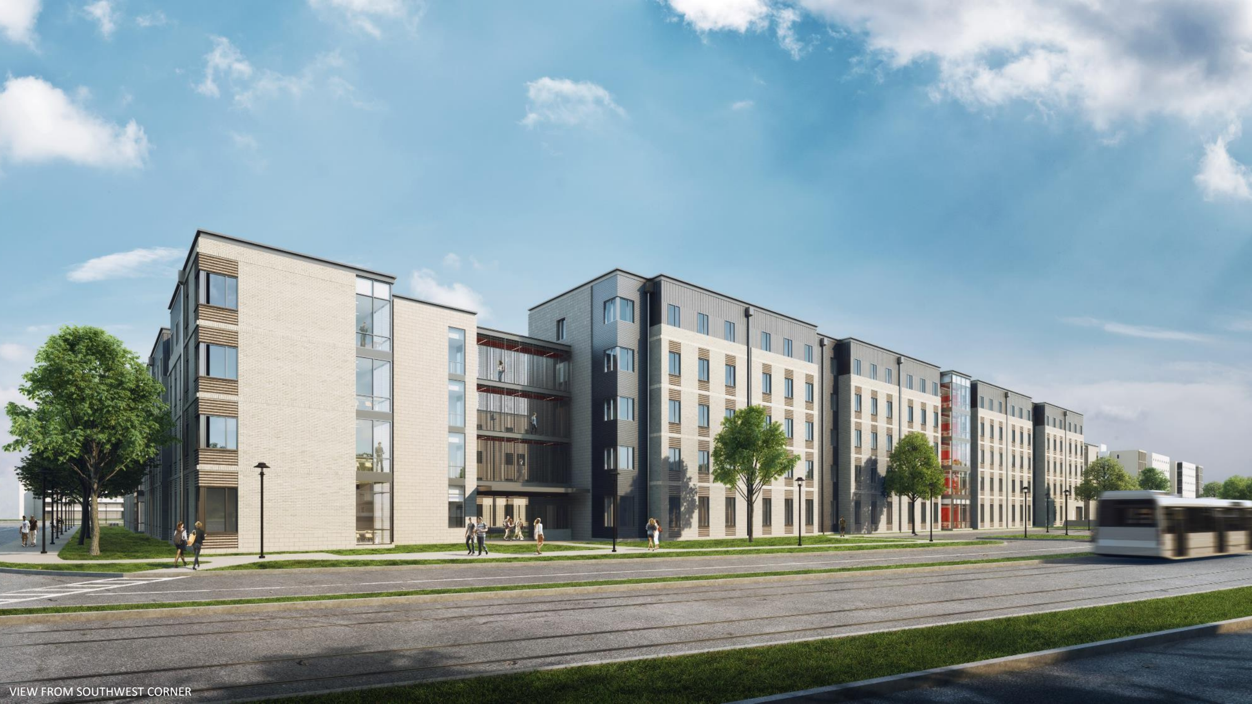
VIEW FROM SOUTHWEST CORNER