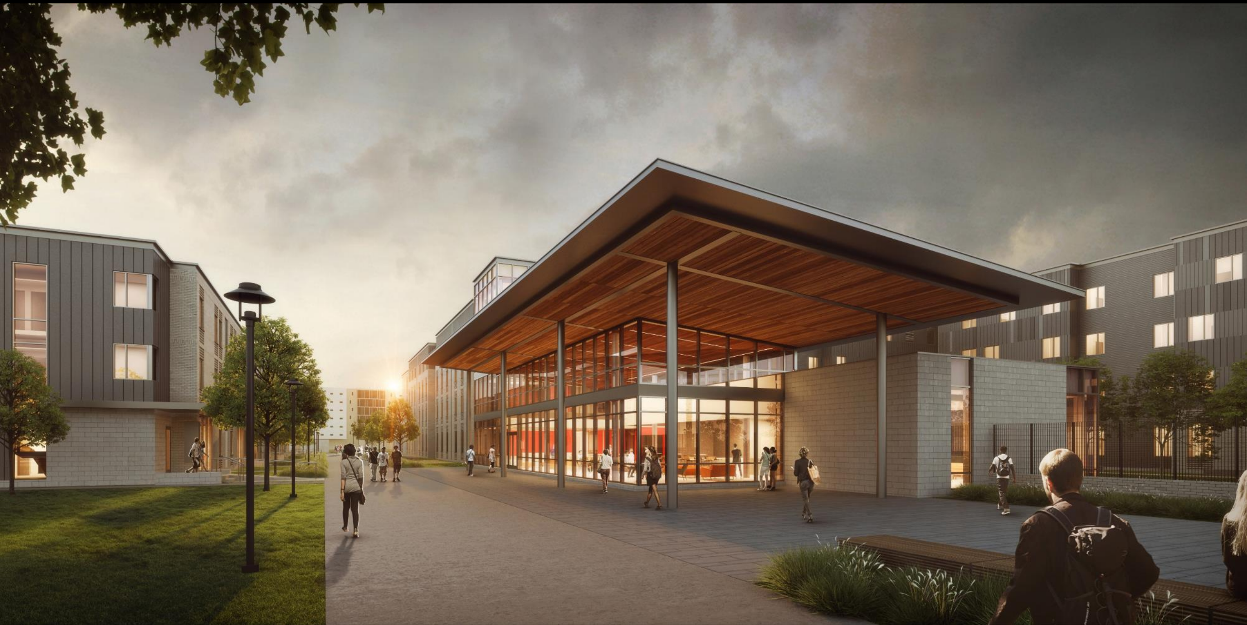
VIEW OF APPROACH FROM COUGAR WOODS DINING