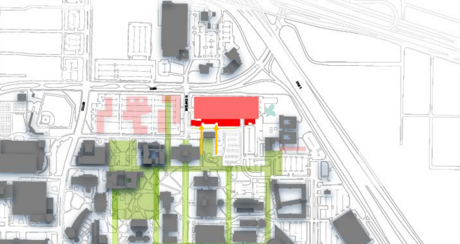
Campus Masterplan – Connect to Urban Forests