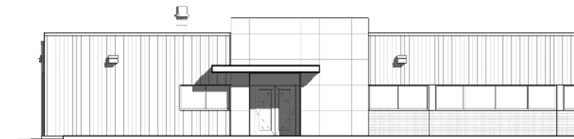
① West Elevation 3/2" = 1'-0"