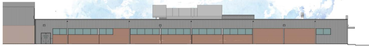
① ELEVATION - NORTH 1/8" = 1'-0"