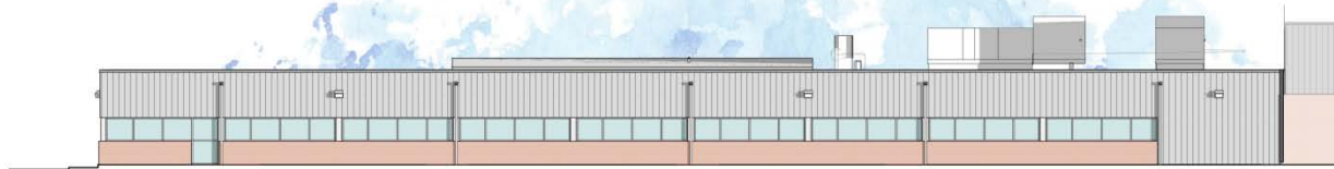
③ ELEVATION - SOUTH 1/8" = 1'-0"