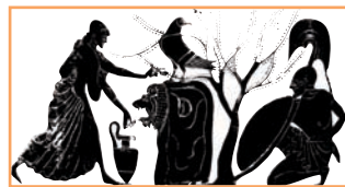
Cover image: Achilles and Polyxena at the fountain. Drawing after a white-ground lekythos in the Toledo(OH) Museum of Art (1947.62)