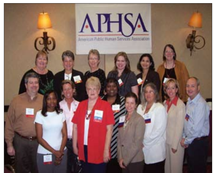
PSTI Receives NSDTA Quality Award