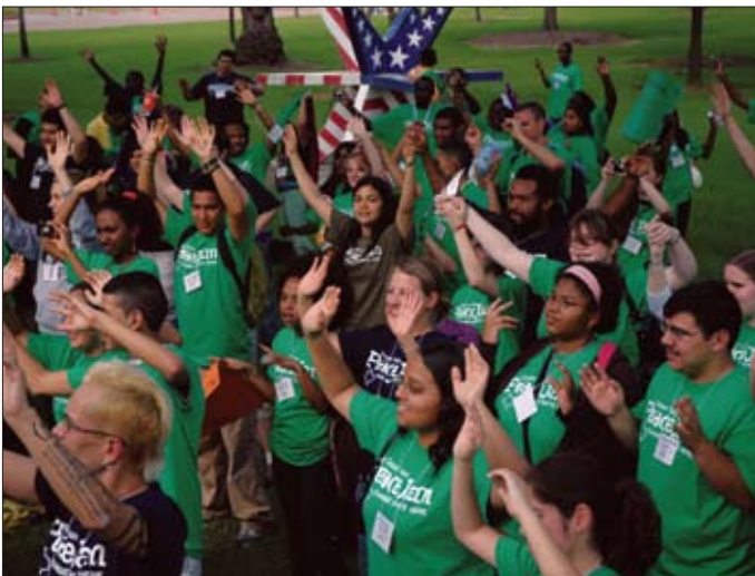
2008 PeaceJam March and Rally