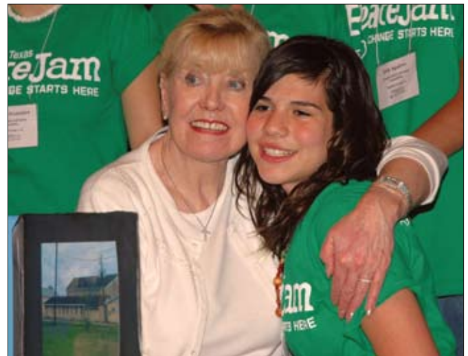
Betty Williams and PeaceJam Youth Participant