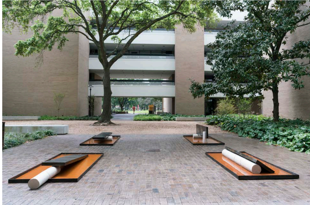
MFA exhibitions continued to Blaffer's corridor space (as seen from museum's main entry) and outdoors, to the Fine Arts Courtyard, for maximum visibility. At left, Kyla Crawford. At right, Trey Duval.