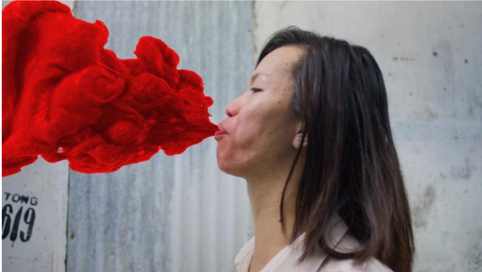
Image: Still from "The Living Need Light, The Dead Need Music," courtesy of the artists

http://blafferartmuseum.org/the-propeller-group/