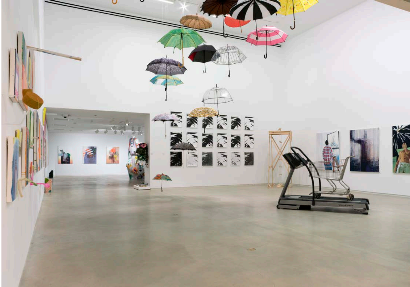
View of 2017's 39 th Annual UH School of Art Master of Art Thesis Exhibition