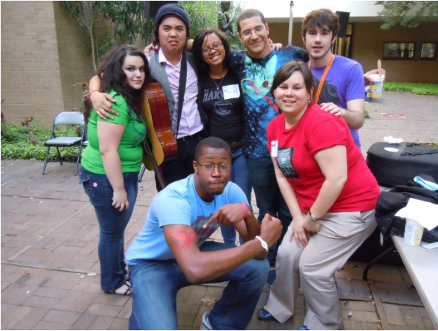
Participants in the spring 2011 Red Block Bash .

The Red Block Bash is the largest, most significant event on the BSA's calendar, a half day-long celebration that welcomes students to campus during each semester. The Bash is held in the Fine Arts courtyard adjacent to the museum where visitors are invited to view the current exhibition and to take part in a series of activities both inside and outside of the museum. At the spring 2011 bash 263 students participated in activities including a collaborative student dance performance, jazz music performances, and museum tours. The bash was held in conjunction with the 2011 School of Art Masters Thesis Exhibition , and was a collaboration between UH students from various disciplines in regards to event promotion, flier posting, prize collection, courtyard décor, and event organization. The fall 2011 Red Block Bash event is scheduled for October 20 and will include performances by Men of Moores, readings by Glass Mountain, face painting, a mural activity, among many other things.