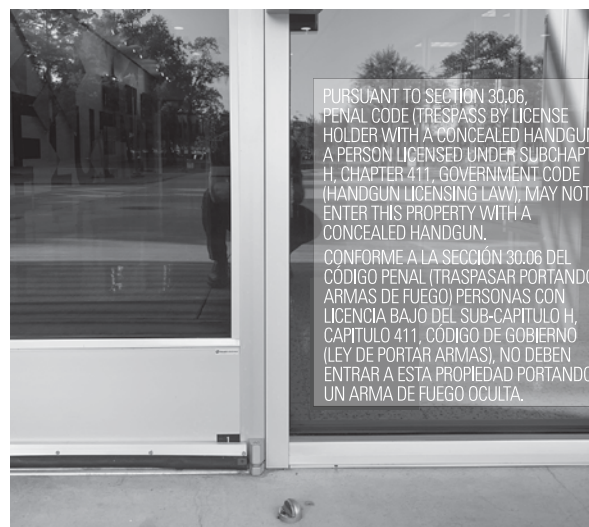
REFERENCE IMAGE - TYPICAL PLACEMENT, SINGLE MYLAR ADHESIVE

Digital Printed Mylar Adhesive Decal (WHITE TEXT) First Surface Application