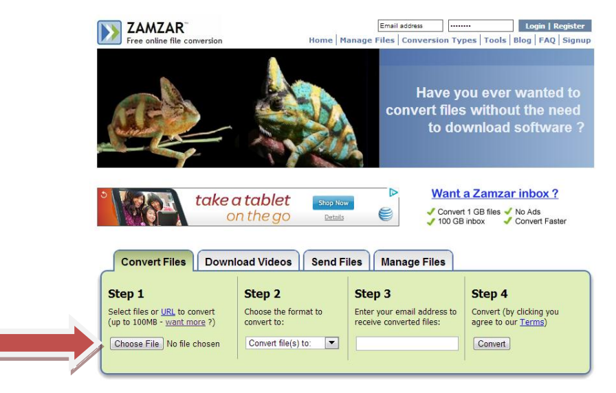
Step 2 Choose the format to convert to (suggestion word doc)

(When using Zamzar you do not need to create an account or sign in, this is a free service for basic converting)