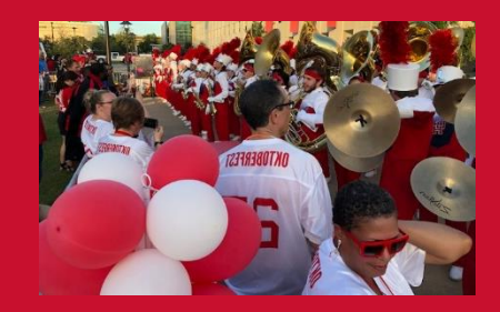
WELCOME BACK TAILGATE & GAME Mark your calendar for Saturday, Sept. 18, 3-5 PM, for the Staff Council Welcome Back Tailgate and Game! Plan now to attend with your colleagues and families. Look for more information in the coming weeks!

Provided by The Rose, Breast Cancer Screenings will be conducted on the main campus in their state of the art mobile coach on October 4, 5, & 6 and at the UT Tech. Bridge on Oct. 8. More information will be announced soon.