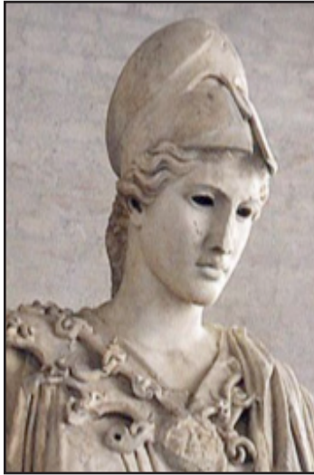
The clear-eyed goddess Athena, patron of the polis, of wisdom, and of war

P hronesis is the Greek word for prudence, or practical wisdom. Aristotle identified it as the distinctive characteristic of political leaders and citizens in adjudicating the ethical and political issues that affect their individual good and the common good.