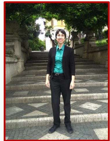
(This is me while serving as Scholar-in-Residence at LUISS-Guido Carli in Rome in May, 2018)