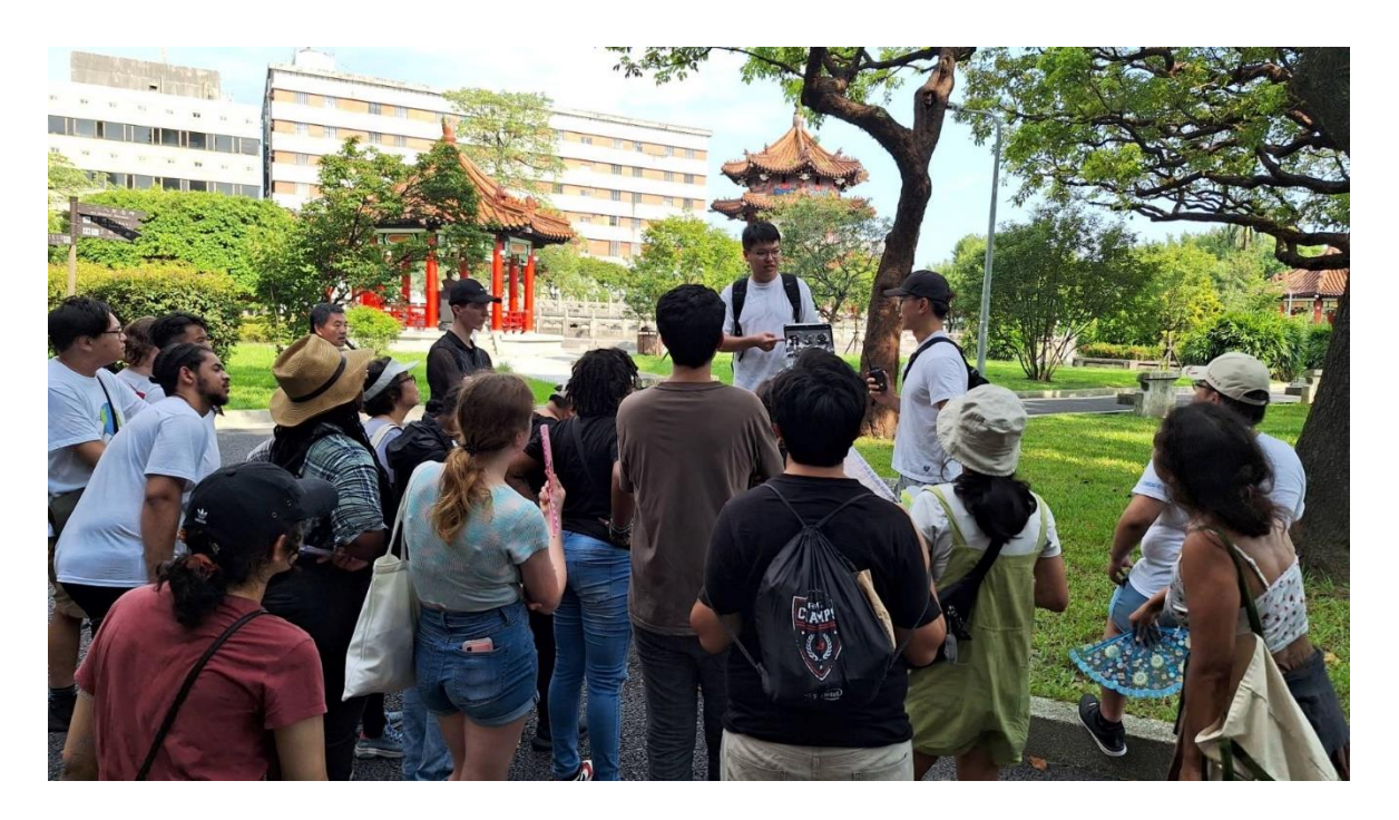
Cultural competency: Learning Chinese tea ceremony.

Cultural competency: Learning Chinese local history from an invited scholar.