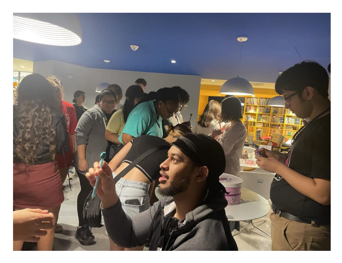
Cultural competency and Team work.