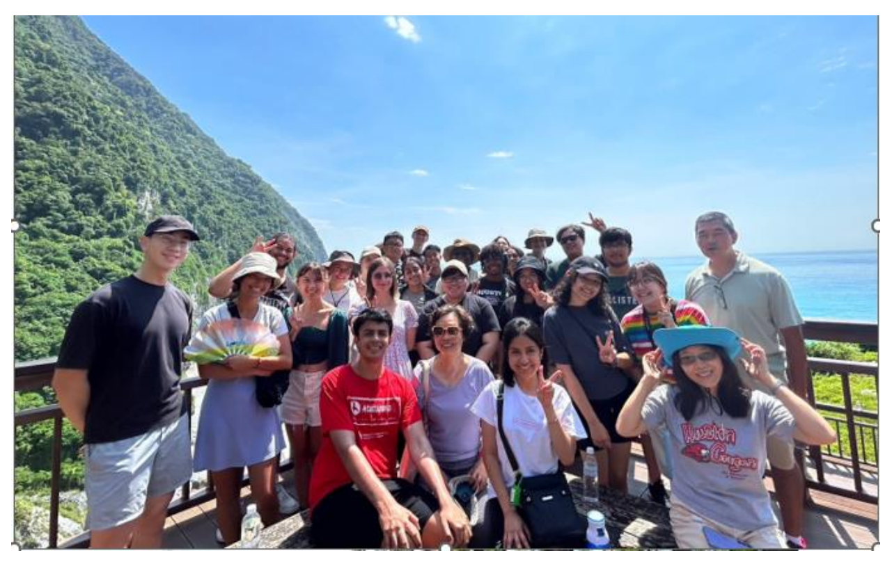
Cultural competency: experience the "Culture Shock"!

Cultural competency: Learning local geology.