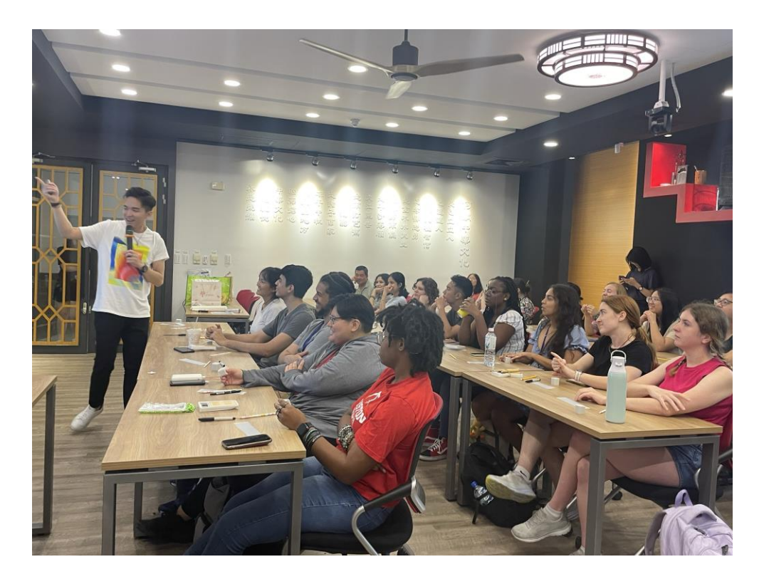
Cultural competency: Learning Chinese history and government.