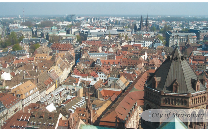
City of Strasbourg

For more information about the program, contact: