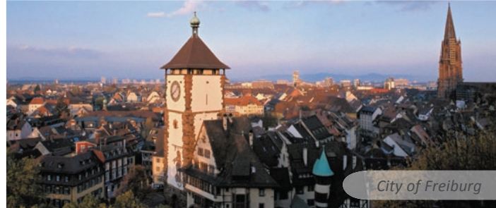
City of Freiburg

Students can take the 3 credit hour course ILAS 2350 "Introduction to Liberal Studies", a learning how to learn course, a hybrid course with seminars interspersed between cultural and sightseeing activities. The online portion of the class students will complete from their homes in December before the trip. Students from any department, college or university can participate.