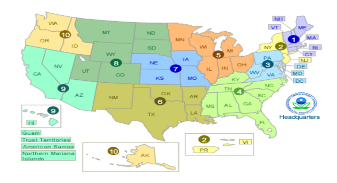
U.S. Environmental Protection Agency (EPA) Regions