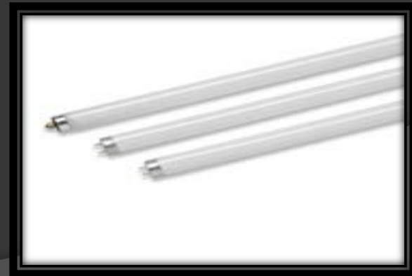
F32T8 tube light; most common with 258 in use