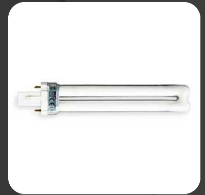
F13BX 13, found in SR Classroom Building