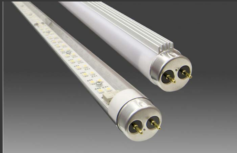
A 17W LED tube to replace the F32T8